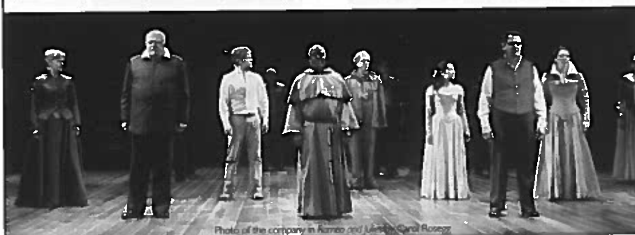
Photo of the company in Romeo and Juliet

Master Acting Classes for Adults and Young People. Fall 2002 classes begin September 14! Call 202.547.5688 for a catalog.