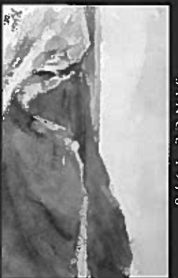
Café of Remains, hand with 5 1/2 x 3 1/2" Hobby's Framemaker