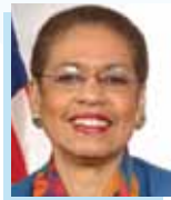
Representative Eleanor Holmes Norton (D-DC) 2008, 2009