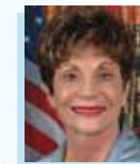
Representative Shelley Berkley (D-NV) 2008, 2009, 2010, 2011