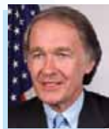
Representative Ed Markey (D-MA) 2009, 2010