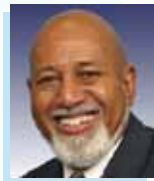
Representative Alcee Hastings (D-FL) 2008