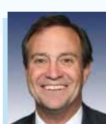
Representative Ed Perlmutter (D-CO) 2009