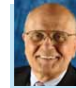
Representative John Dingell (D-MI) 2008