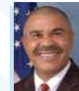
Representative William Lacy Clay (D-MO) 2009