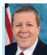
Representative John Tanner (D-TN) 2008