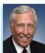
Representative Steny Hoyer (D-MD) 2009, 2010