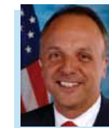
Representative Ted Deutch (D-FL) 2011