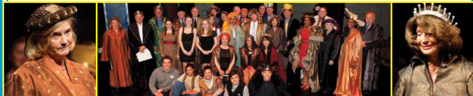
Cover Photos: Rep. Ted Deutch (D-FL) and Rep. Jim McDermott (D-WA); Rep. Joe Barton (R-TX) and Rep. Eleanor Holmes Norton (D-DC); Rep. Virginia Foxx (R-NC), Rep. Shelley Berkley (D-NV), Rep. Mike McIntyre (D-NC), Rep. Jim McDermott (D-WA) and Rep. Donna Edwards (D-MD); and Senator Roger Wicker (R-MS). Above photos: Rep. Donna Edwards (D-MD); Rep. Chellie Pingree (D-ME); The 2011 Will on the Hill cast and participating Text Alive! students from Westfield High School; and Rep. Shelley Berkley (D-NV).

Altria • American Airlines • AT&T • The BGR Foundation • Capitol File Magazine • Carnival Foundation • CoStar Group, Inc • FedEx • Fleishman-Hillard The Hill Newspaper • Hogan Lovells • Humana • Intuit • MapHook • McDermott Will & Emery • Mortgage Insurance Companies of America • Nissan North America Oracle • Patton Boggs • PEPCO • Promontory Financial Group • Time Warner • Turner & Goss • Vulcan Materials Company • Washington Life Magazine