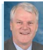
Representative Brian Baird (D-WA) 2009, 2010