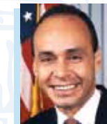
Representative Luis Gutierrez (D-IL) 2008, 2009