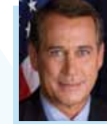
Representative John Boehner (R-OH) 2009, 2010