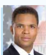
Representative Jesse Jackson, Jr. (D-IL) 2010