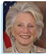
Representative Jane Harman (D-CA) 2008, 2009