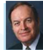
Senator Richard Shelby (R-AL) 2008