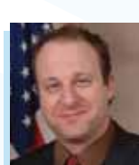
Representative Jared Polis (D-CO) 2010, 2011