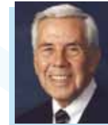
Senator Richard G. Lugar (R-IN) 2010