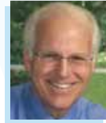
Representative Christopher Shays (R-CT) 2008