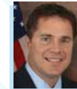
Representative Bruce Braley (D-IA) 2010, 2011