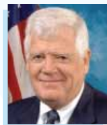
Representative Jim McDermott (D-WA) 2008, 2009, 2010, 2011