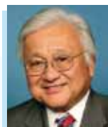
Representative Mike Honda (D-CA) 2008