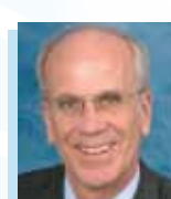
Representative Peter Welch (D-VT) 2009