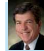
Representative Roy Blunt (R-MO) 2008