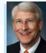
Senator Roger F. Wicker (R-MS) 2009, 2010, 2011