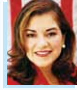
Representative Loretta Sanchez (D-CA) 2008