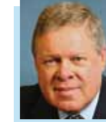
Representative Norm Dicks (D-WA) 2009