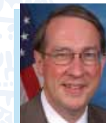
Representative Bob Goodlatte (R-VA) 2010, 2011