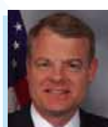
Representative Mike McIntyre (D-NC) 2009, 2010, 2011