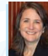
Representative Diana DeGette (D-CO) 2008, 2011