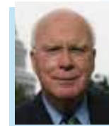
Senator Patrick Leahy (D-VT) 2008, 2011