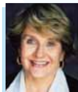
Representative Louise McIntosh Slaughter (D-NY) 2008, 2010