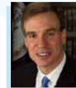
Senator Mark Warner (D-VA) 2009, 2010