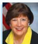
Representative Darlene Hooley (D-OR) 2008