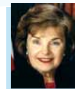
Senator Dianne Feinstein (D-CA) 2008

Each year, Senators and Representatives, along with D.C. business leaders and media personalities, show off their acting skills as members of the cast of Will on the Hill. Over the past three years, 45 Members of Congress have served as Honorary Co-Chairs or performed on stage at Sidney Harman Hall in this humorous benefit that provides much-needed support for the Company's artistic, education and community outreach programs.