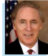
Representative Cliff Stearns (R-FL) 2008