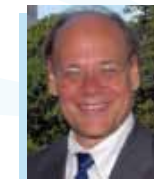
Representative Steve Cohen (D-TN) 2010