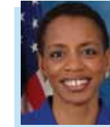
Representative Donna Edwards (D-MD) 2009, 2010, 2011