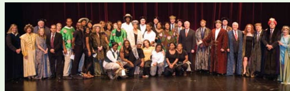
Photo: Will on the Hill cast and Charles Flowers students.

On Monday, April 26th, participants of the Text Alive! program performed a scene from As You Like It on stage at Sidney Harman Hall. Afterward, the Charles Flowers High School students went backstage to meet the cast members of The Play's the Thing!